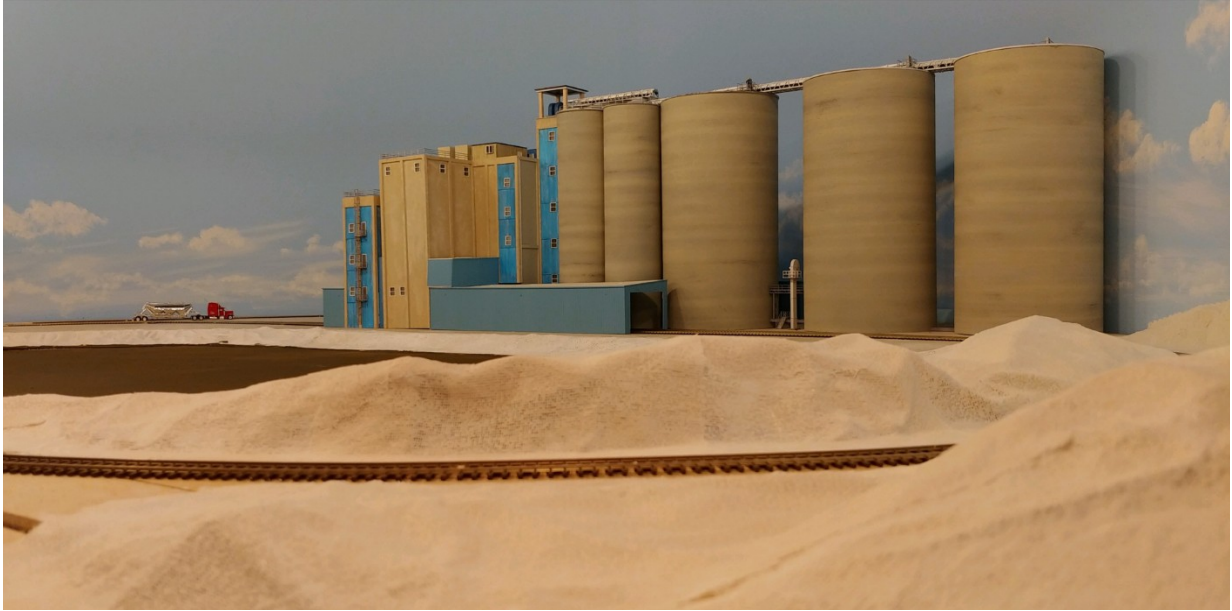
And here we have the left view showing the office building with the pond bottom painted.